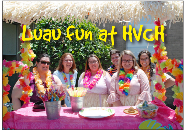
HVCH held a luau in the courtyard this week with a tiki bar and nonalcoholic cocktails for employees to enjoy and take a break in the summer sun.